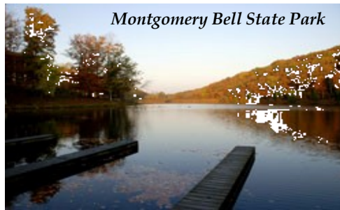
Montgomery Bell State Park

200 4th Avenue North Suite 810 Nashville, TN 37219 (615) 741-3238 Call toll free at: (877) 424-8527